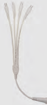
33cm x 4